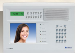
M200 Compact Master Station with LCD video display and a host of new features.

Fascia: 320(w) x 390(h) Recess: 270(w) x 325(h) x 75(d)mm