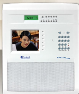
Traditional Master Station sized to retro-fit existing Valet and Electron master installations.

Max. Master Stations: 1 Max. Room Stations: 20 (if no master or door stations installed). Max. Door Stations: 3