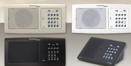
Room Stations are available in White, Ivory and Black. Recess mounted with surface mounting option.

Recessed door stations & room stations, Fascia: 265(w) x 130(h) Recess: 205(w) x 95(h) x 30(d)mm Surface mount Metal Door Stn 100(w) x 173(h) x 25(d) with flush option