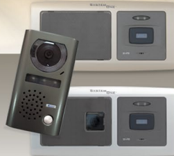
Front Door Stations with video options available in Bronze and Silver.

Fascia: 320(w) x 232(h) Recess: 280(w) x 190(h) x 75(d)mm