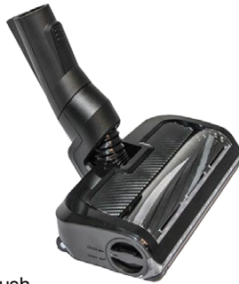
VAC-419 Cordless Power Brush